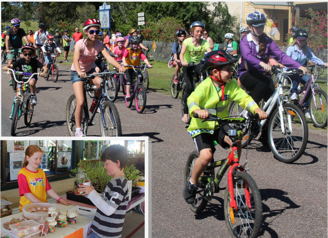
A beautiful day at Glen William School Markets