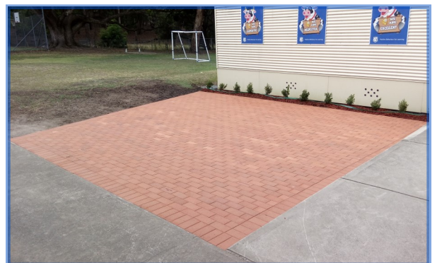
Check out our new paved area near the infants room.

How do we ensure schools are places where students want to be?